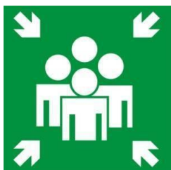
Figure 3 - Assembly point

Upon hearing the evacuation alarm, everyone should exit the building by the nearest emergency door and proceed to the designated assembly point (Figure 2). The instructions given by the BHV officers and/or security personnel must be followed. The nearest emergency exit can be found by following the escape route signage (Figure 4).